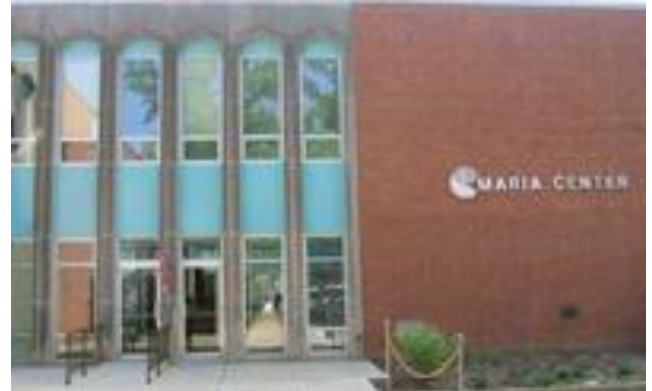
The Spring Conference will be held in the Maria Center

Founded in 1897 for Notre Dame sisters, the school opened its doors to boarders and day students in 1934. Significant changes in the curriculum were introduced over the years: advanced college credit courses, modular scheduling and more extensive elective courses. The school utilizes differentiated instruction, a student-centered model offering students an individualized approach to education. Currently the enrollment is 270 students, 100% of whom graduate with all pursuing college/university education. For more information, go to their website: www.ndhs.net .