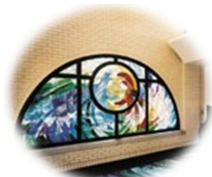
The Visitation window in the main entry at Visitation Academy.

Enter the building through the doors at the end of the circle drive. [You will see a statue of the Sacred Heart.] DeChantal Hall will be to the left of the registration table. Coffee and vendor displays will be to the right.