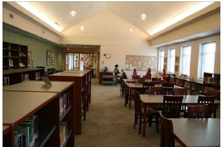
The vibrant Emily Lemcke Memorial Library houses over 6,300 quality children's books all obtained from donation and library fund raisers.